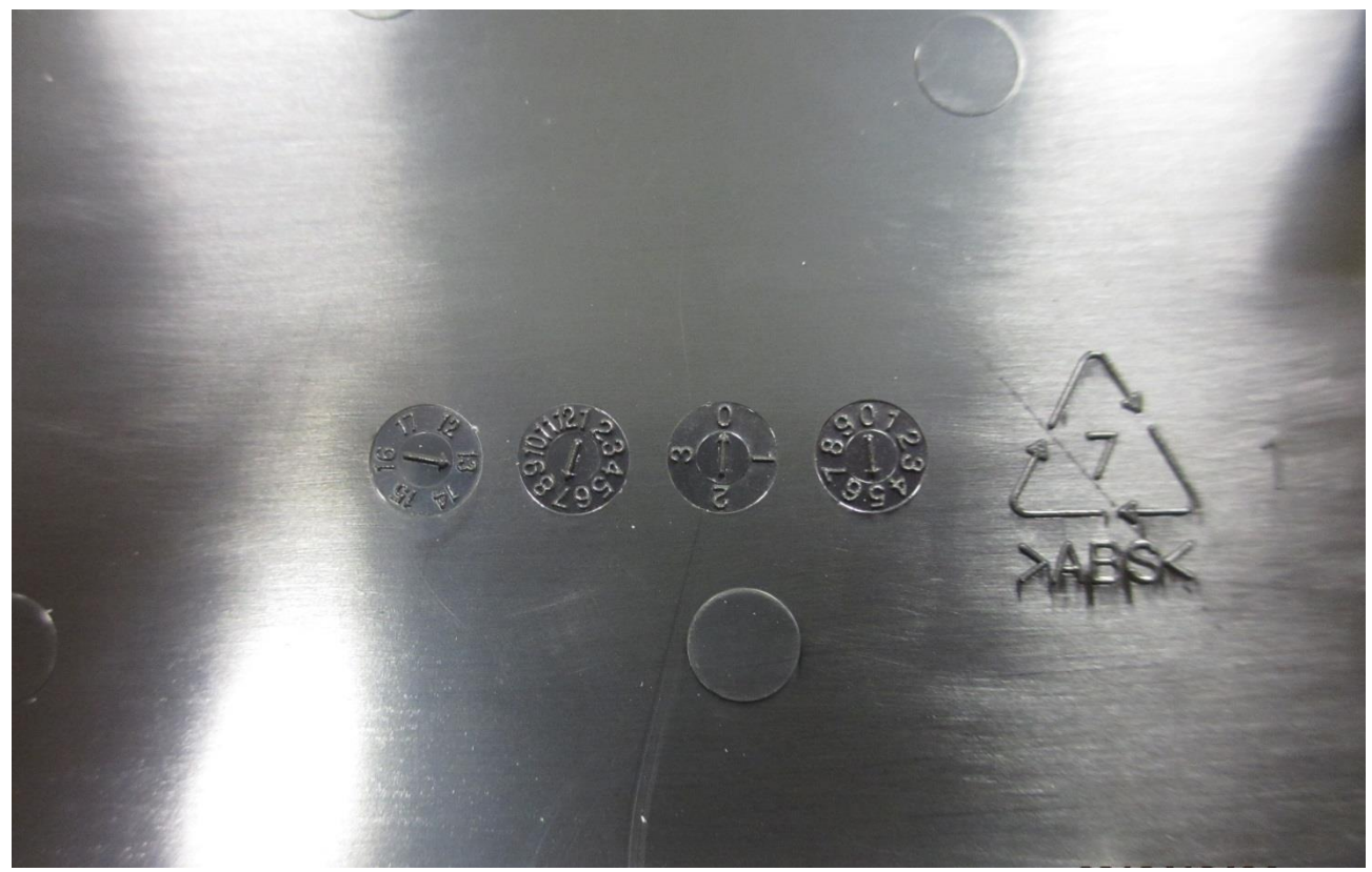
The main material of enclosure is ABS material.