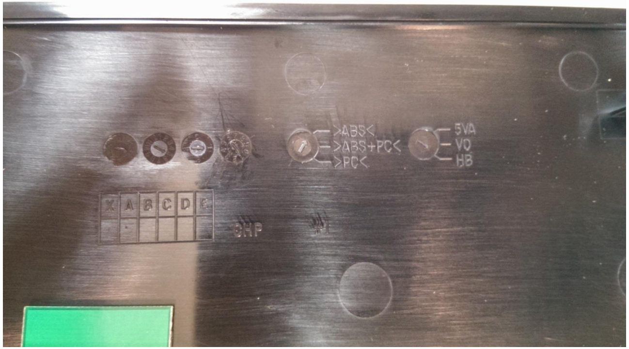
The main material of enclosure is ABS material.